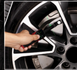
Brake Disc Wear Analysis